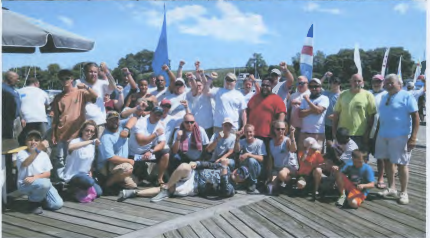
MSBC WINNERS 2017 Interclub Bluefish Tourney