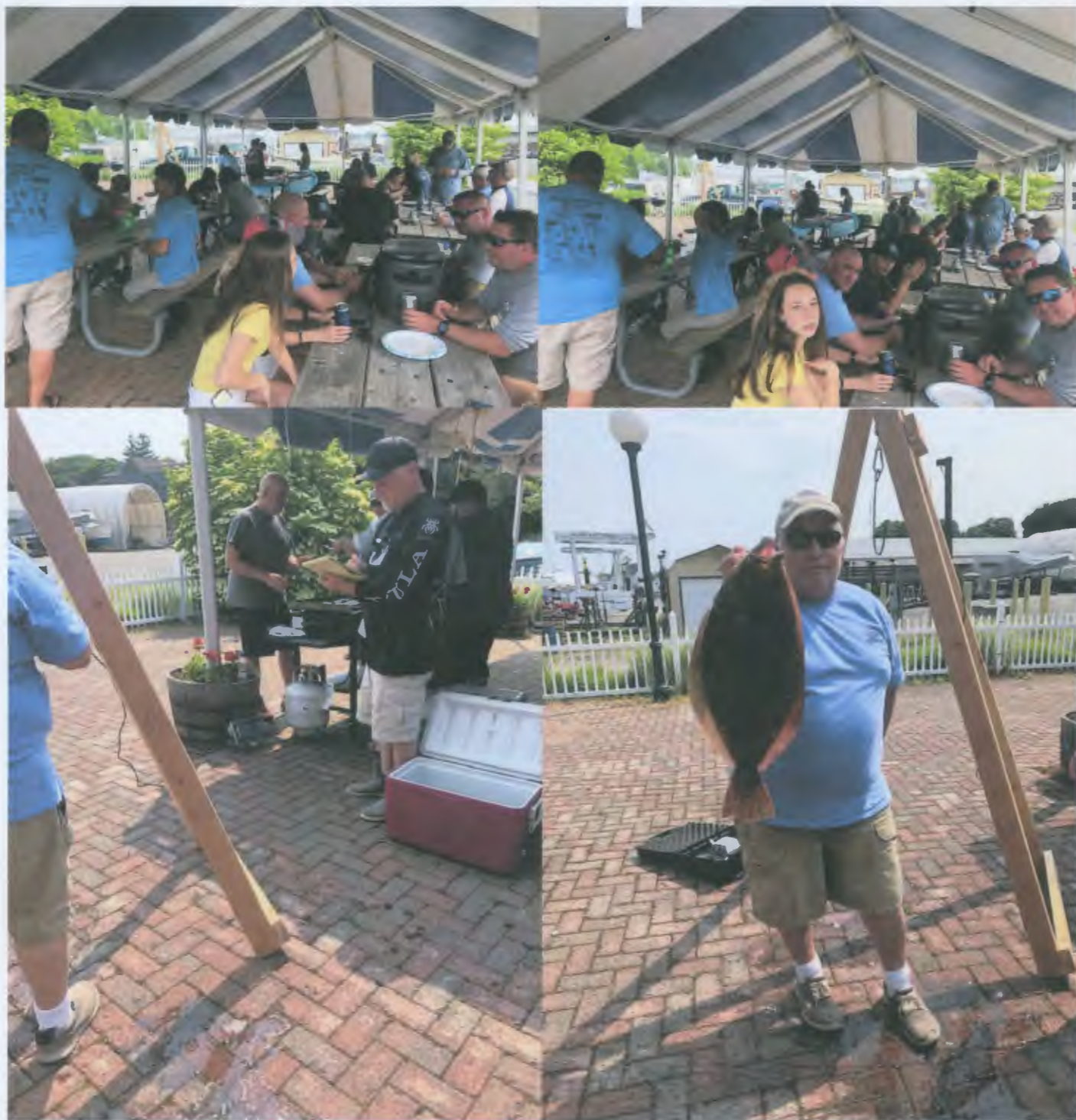
2019 Fluke Shootout