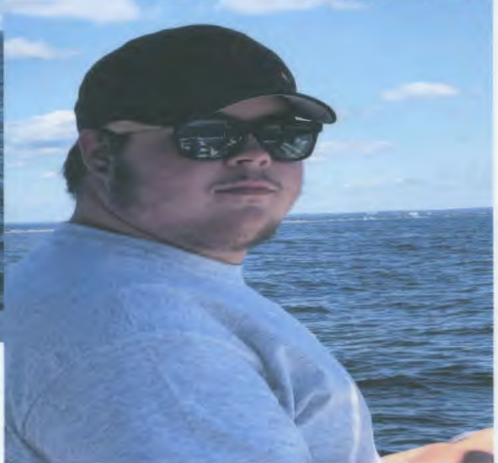
The Good Life